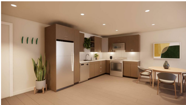
Renderings in progress